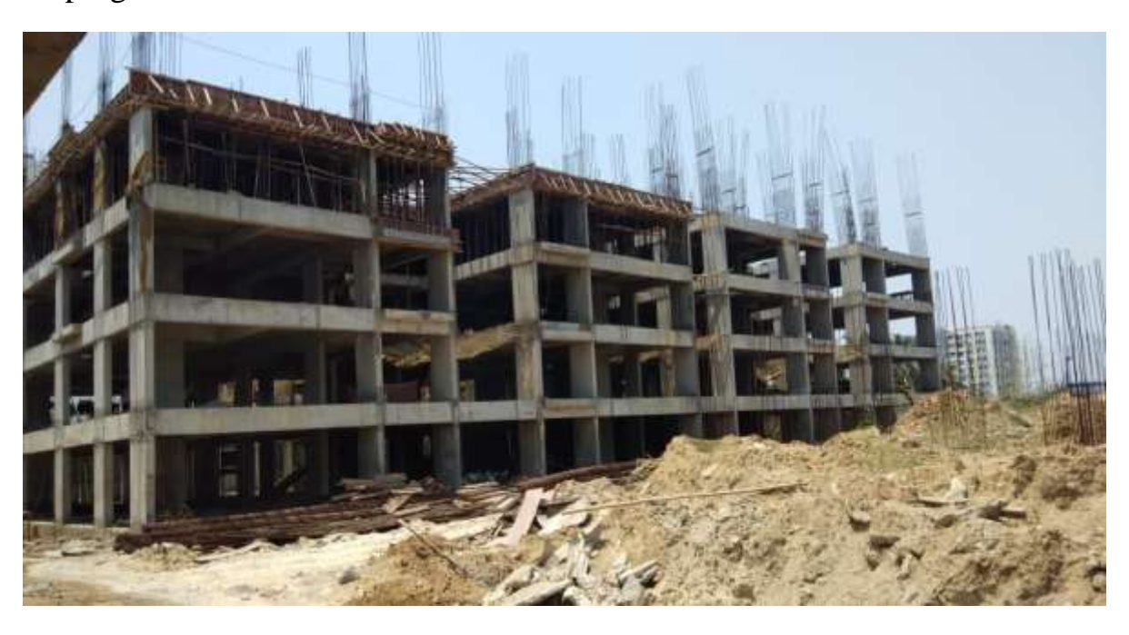
In Block D3: First floor Column Shuttering and Bar bending Works in Progress.

In Block D2: Fourth floor level slab 2nd half Shuttering & Bar Bending work on progress.