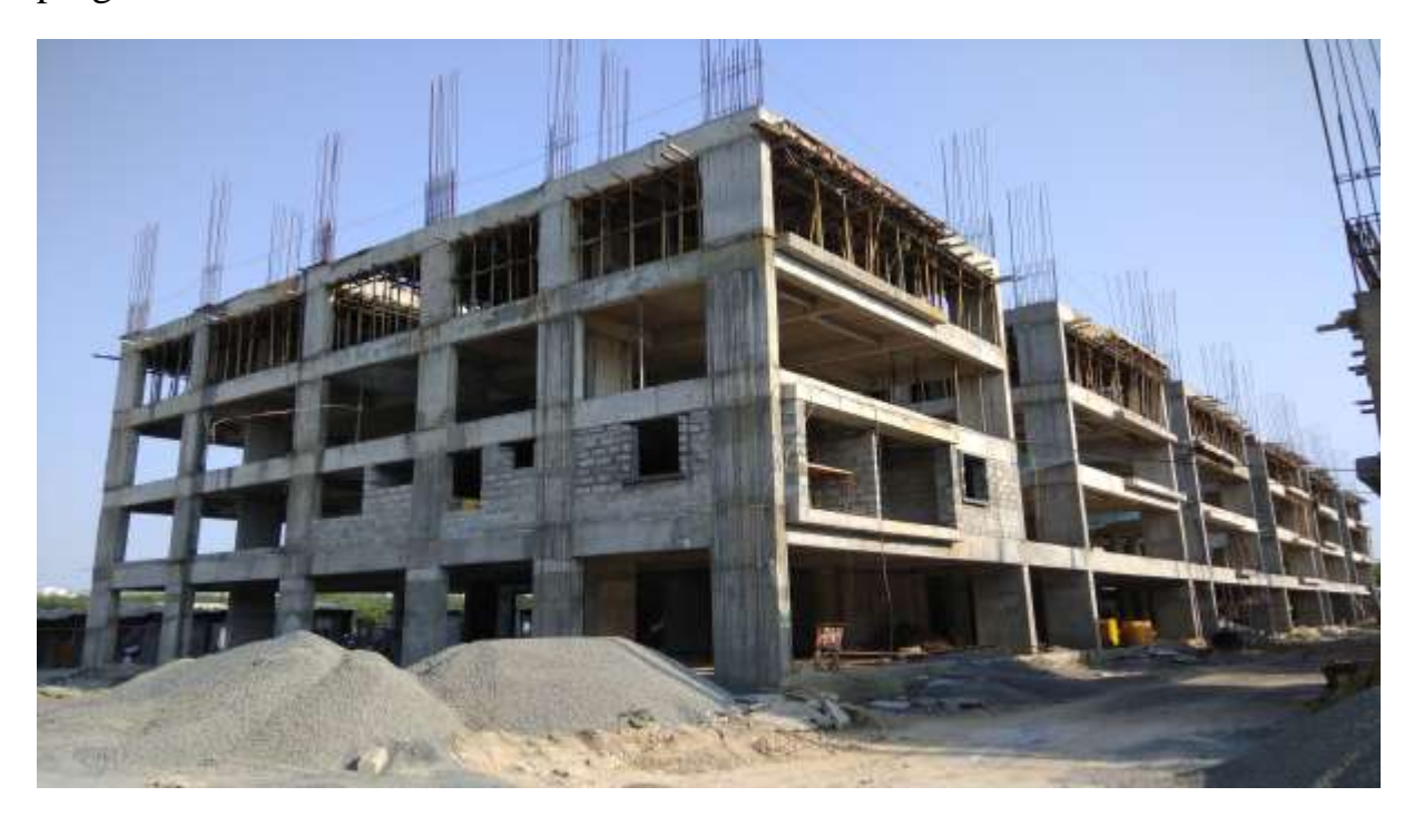
In Block C2: Second Floor level Slab 1<sup>st</sup> half Shuttering & Bar bending work in progress.

In Block C1: Fourth Floor level 2<sup>nd</sup> half Shuttering & Bar bending work in progress.